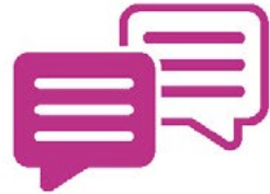
SGILIAU CYFATHREBU COMMUNICATION SKILLS