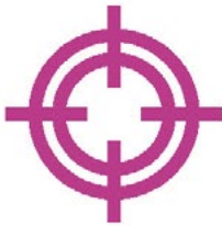
DAWN CANOLBWYNTIO CONCENTRATION