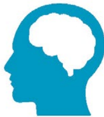
YMENNYDD MWY BIGGER BRAINS